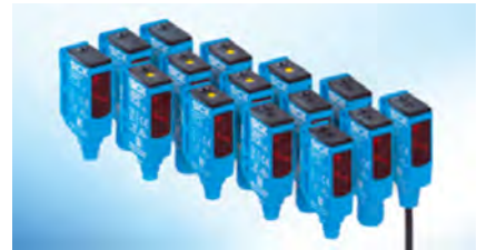
Diverse connection concepts: M8 and M12 male connector, cable as well as cable with M12 male connector