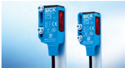
Housing variants for M3 and M4 fixing screws Slots make it possible to move the sensor on the screw