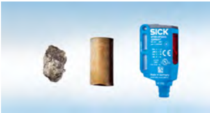
Rugged VISTAL™ housing offers maximum mechanical stability

The rugged VISTAL™ housing offers very high mechanical stability and therefore high sensor availability. The use of glass-fiber reinforced plastic combined with high-performance adhesives ensures excellent housing sealing and makes it resistant to cleaning agents. The laser inscription is easy to read even if the sensor has already been in use for years.