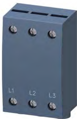
3-phase supply terminal for 3-phase busbar Size S0 and S00 connection from below