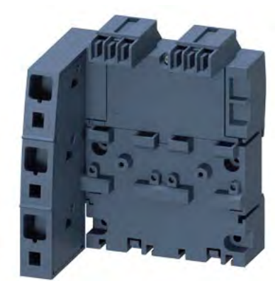
3-phase busbar with infeed left for 2 circuit breakers Size S00 and S0