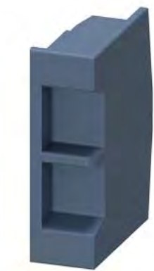
End cover for 3-phase busbar 3RV2917 Multi-unit packaging 10 units