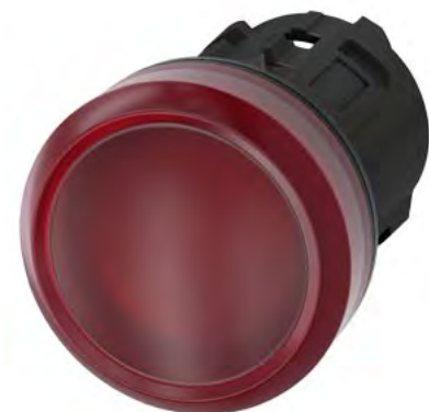
Indicator lights, 22 mm, round, plastic, red, lens, smooth