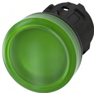
Indicator lights, 22 mm, round, plastic, green, lens, smooth