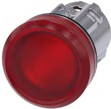
Indicator lights, 22 mm, round, metal, shiny, red, lens, smooth