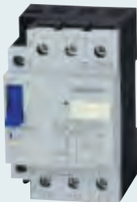
Fuse Monitoring MPCB - 3VU1340-1MS00

3VU1340-1MS00 is offered for Fuse Monitoring application. This device is connected in parallel to the fuses. In case one of the fuses blows, the rated current will flow through the corresponding phase of this MPCB. MPCB, through its auxiliary contacts, provides a tripping signal to the contactor and thus the motor will be switched off. Hence, the motor will be protected from single phasing. (Refer page 51 for connection diagram)