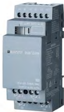
LOGO! DM8 12/24R expansion module, PS/I/O: 12, 24V/12V/24V/relay, 2 MW, 4 DI/4 DO for LOGO! 8