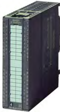
SIMATIC S7-300, Digital input SM 321, Isolated 32 DI, 24 V DC, 1x 40-pole