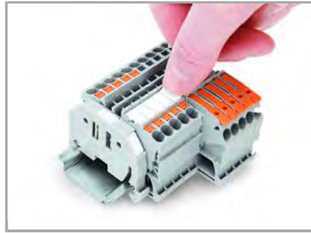
Snapping a marking strip into the marker slot.