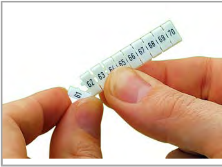
Separating an individual marker from the WMB marker strip – for larger terminal blocks.