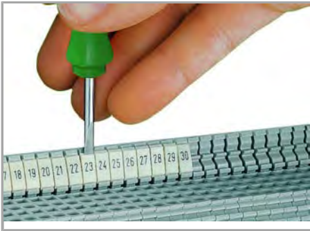
Snapping a WMB marker strip into the marker slot of the double marker carrier.