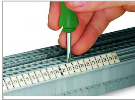
Snapping a marking strip into the marker slot.