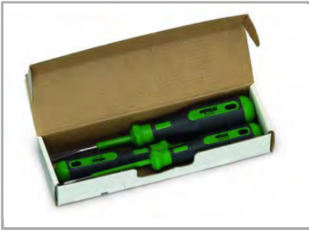
BSet of operating tools in a box

Subject to changes. Please also observe the further product documentation!