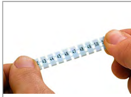
Stretching a WMB marker strip.