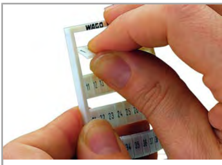
Separating a strip from the WMB marker card.