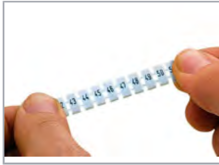
Stretching a WMB marker strip.