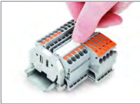
Snapping a marking strip into the marker slot.