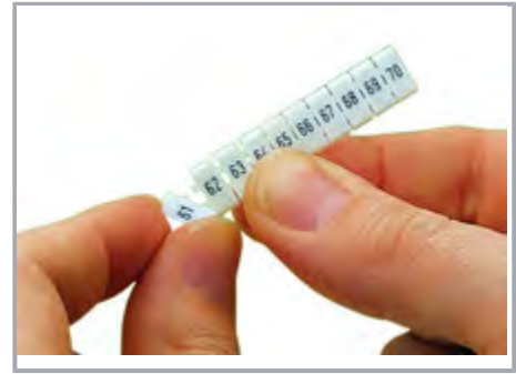
Separating an individual marker from the WMB marker strip – for larger terminal blocks.