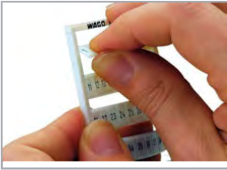
Separating a strip from the WMB or WMB marker card.