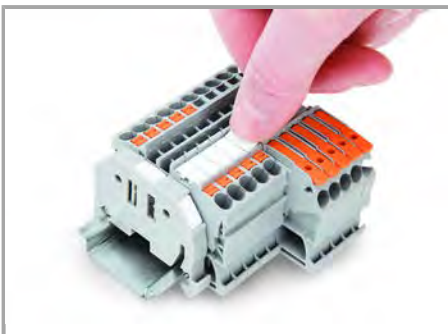
Snapping a marking strip into the marker slot.